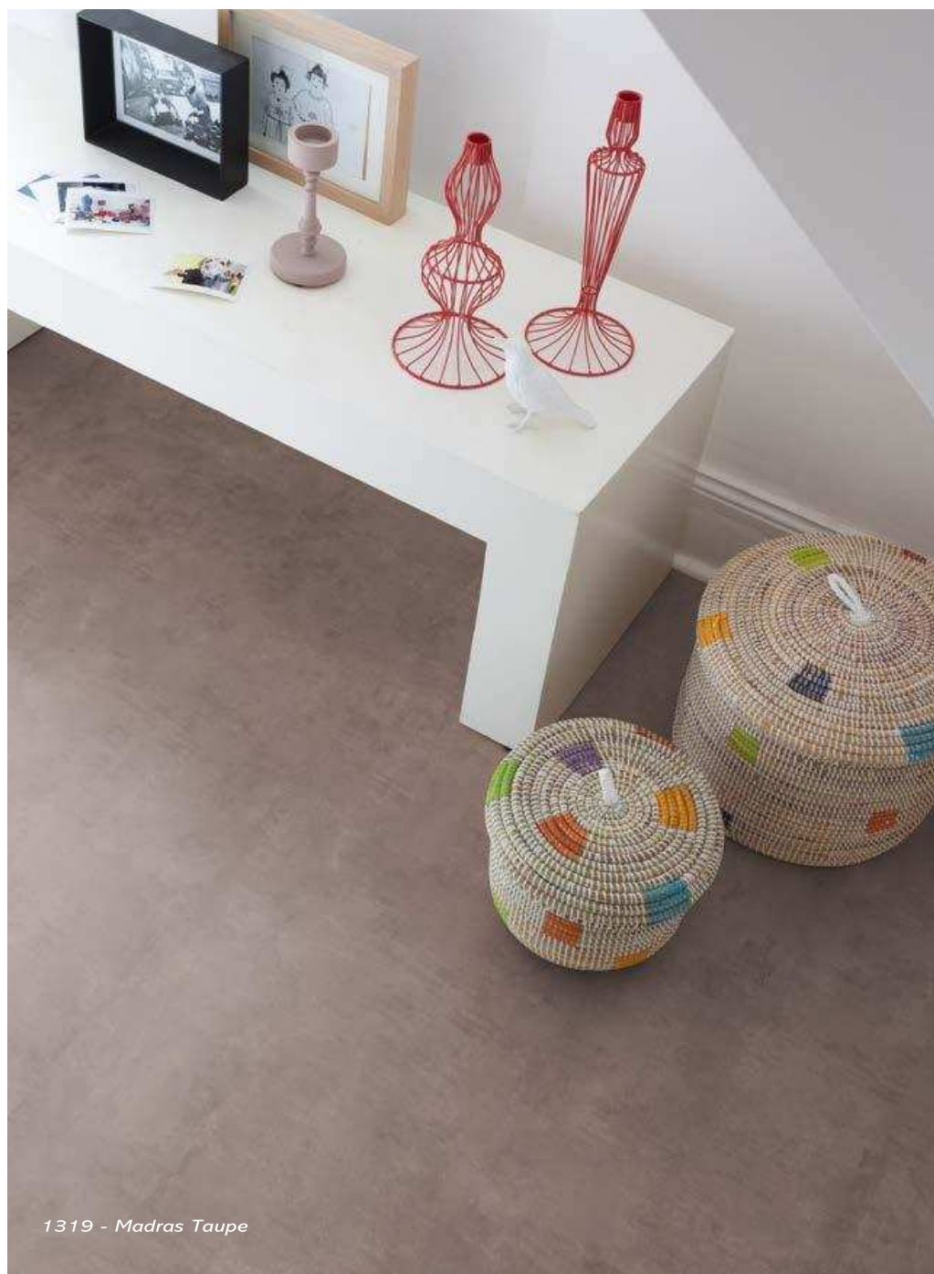
1319 - Madras Taupe

4m - Code: 1627 1319 - EAN: 3475710337406