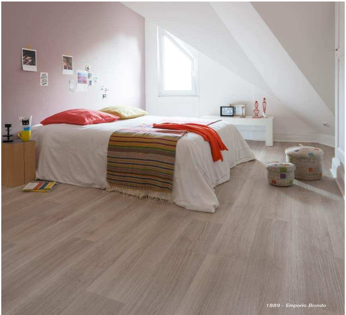
1889 - Emporio Biondo